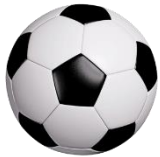
Football / Soccer