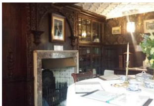
1. Dining Room

Once upon a time, in a faraway village by a great river there lived two unconventional ladies (or better, three) sharing an unconventional house. As much of a fairy tale as it may sound, this is no fictional story, but actual facts: the name of the village was Llangollen, Wales, and the two ladies – two Irish noblewomen accompanied by a maid, Mary Caryll – were named Eleanor Butler (1739-1829) and Sarah Ponsonby (1755-1831). The house, still extant today, is a five-roomed cottage enlarged to include many Gothic features. The grandest room in the house is the dining room 1 , oak-paneled and featuring a magnificent majolica fireplace at its center. The Tudor bedroom is equally remarkable, with its stained-glass windows 2 and canopy bed 3 . The music room (also known as library or drawing room 4 ) makes a yet further little gem thanks to its oak-and-majolica fireplace, its stained-glass window, its piano as well as its harp. Not to mention the rich wooden carvings on the staircase 5 and the porch 6 , which contribute to make Plas Newydd a unique, fairy-tale place in the middle of nowhere. Eleanor's, Sarah's and Mary's memory still lingers there, making this cottage a place of unconventional beauty and norm-breaking love.