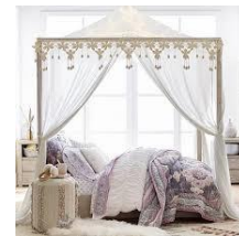
3. Canopy Bed