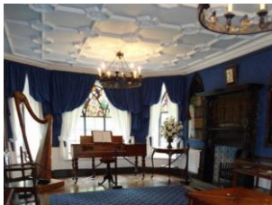
4. Drawing Room