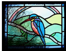
2. Stained-Glass Window